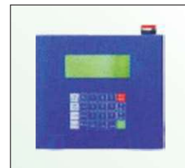
Electronic Controller (Optional Standalone System)