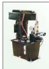
Torque compensate power pack