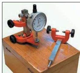
Mechanical Extensometer Least Count 0.01 mm