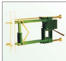
Electronic extensometer with 1 micron accuracy & interfacing software to PC